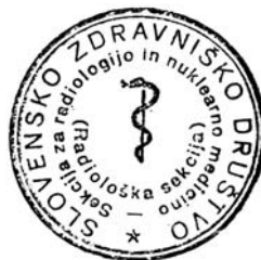
Figure 6. Section of Radiology and Nuclear Medicine of the Slovenian Medical Association.