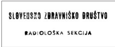
Figure 2. Section of Radiology of the Slovenian Medical Association.