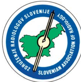
Figure 15. Slovenian Association of Radiology in the late 1990s.