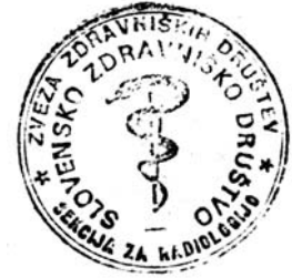
Figure 7. Section of Radiology of the Slovenian Medical Association.