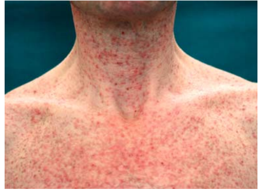
Figure 2. Typical acneiform eruption caused by EGFR inhibitors.

1 acneiform rash skin reaction at the time we started to manage skin rash.