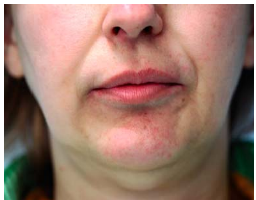
Figure 6b. The skin after 1 week of using vitamin K1 crème.