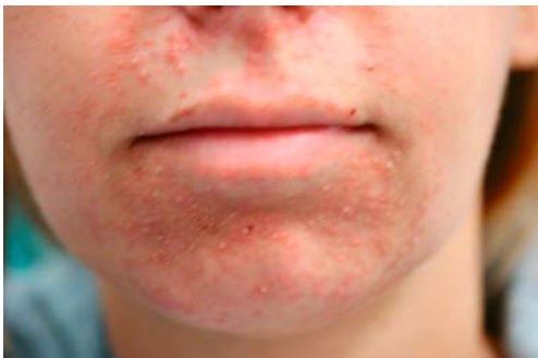
Figure 4a. Acneiform rash before treatment with vitamin K1 crème.

In all patients skin care with K1 crème twice per day was performed. For grade 2 acneiform eruptions, topical antibiotic preparations, mostly clindamycin (1%) and erythromycin, are used according to the antibiograms and experiences, concomitantly with vitamin K1 crème, when pustules were observed. We used systemic antibiotics in 4