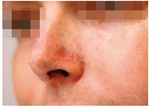
Figure 5b. The skin after 1 week of using vitamin K1 crème.

patients with G3 skin rash and topical antibiotics in 2 patients with G3 and 5 patients with G2 skin rash.