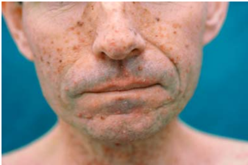
Figure 3. Typical acneiform eruption caused by EGFR inhibitors.

Acneiform eruptions compared to the acne vulgaris are different and are appearing on the changed skin which is very dry and