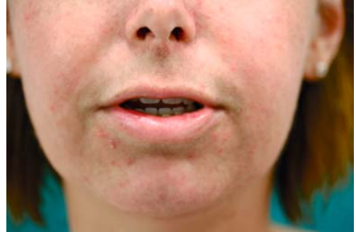
Figure 4b. The skin after 1 week of using vitamin K1 crème.