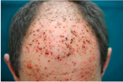
Figure 7a. Acneiform rash before treatment with vitamin K1 crème.