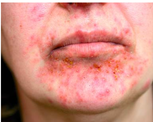
Figure 6a. Acneiform rash before treatment with vitamin K1 crème.

In a group of patients, where we used vitamin K1 crème, 3 and 6 months after the treatment we did not observe any xeroderma or telangiectasias, even they are frequently noticed in the cetuximab treatment; especially we observed them in patients before using vitamin K1 crème.