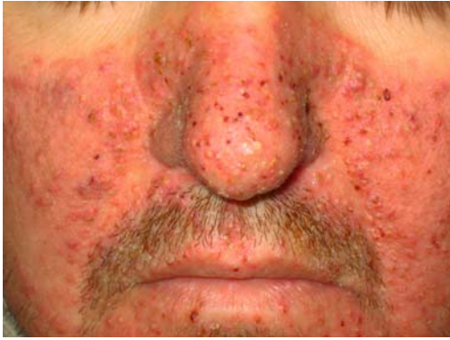
Figure 1. Typical acneiform eruption caused by EGFR inhibitors.