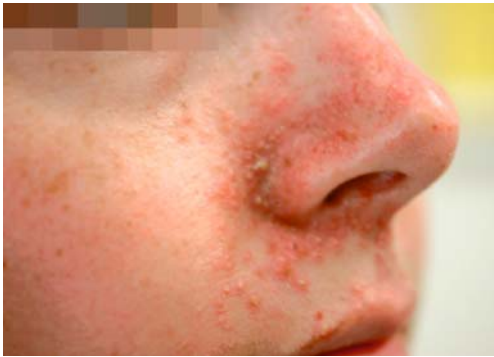
Figure 5a. Acneiform rash before treatment with vitamin K1 crème.