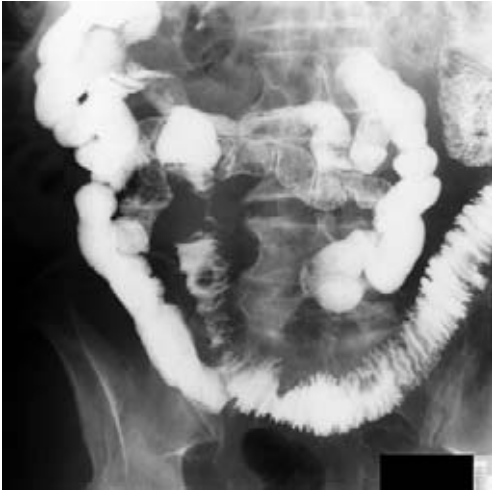
Figure 2. SBFT: Stenosis and an oval formation in the distal jejunum, causing a relative obstruction, thickened mucosal folds and irregular bowel wall proximally .

The patient was admitted to surgery. Implantation of pace maker for his arrhythmia was needed before he could be operated upon (5 days later). A 30 cm long segment of the jejunum was resected. Appendectomy was also performed. The histopathologic diagnosis was adenocarcinoma of the small bowel. One out of 17 nodes in the mesentery was found malignant. Lymphangiocarcinomatosis of the mesentery was also established.