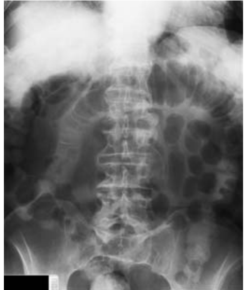
Figure 1. Abdominal plain film: dilated small bowel loops – obstruction.

An 83-year-old man with arterial hypertension was first referred to the proctologist because of difficult defecation, abdominal pain and diarrhoea lasting for about one month. On proctoscopy, polyp of 5 – times 5 mm was found in the rectum. It was resected at a later colonoscopy and sent for histological examination. Some diverticula were also observed. With the upper GI endoscopy signs of chronic atrophic gastritis were found. With abdominal ultrasonography small cysts in the right kidney were revealed. However, the results of all examinations could not explain the patient's problems. Two months later the patient returned to the emergency department, for the third time in one month, because of severe vomiting and weight loss. Haemoglobin level was found normal. Dilated small bowel was observed on abdominal plain film (Figure 1), while no signs of acute abdomen were seen on physical examination, leading abdominal surgeons at the first two patient's visits to conclusion that there was no indication for surgery. At the third patient's visit to the