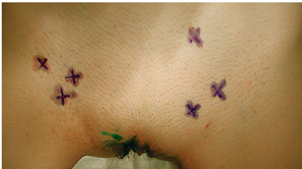
Figure 2. Active nodes were marked on the skin.

down to the femoral canal were removed. The patient underwent also CT examination which detected that deeply seated pelvic lymph nodes were also metastatic.