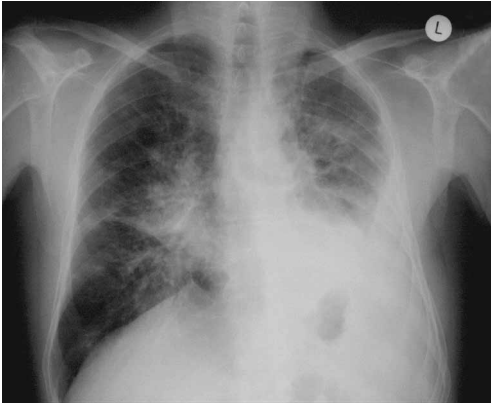
Figure 1. Lung tumour after chemotherapy; visible nonhomogenous lung infiltrates