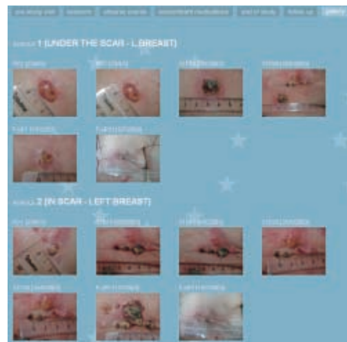
Figure 3. Image gallery: images are grouped by nodule and sorted by time.