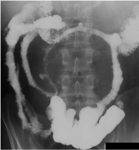
Figure 3. Crohn's disease of the small bowel.

mosis stenosis was found on SBFT, confirmed by surgery. One patient had a resection of terminal ileum. Inflammatory changes of distal ileum, seen on SBFT, were confirmed endoscopically (Figure 4). In 2 cases the findings on SBFT were normal; at coloileoscopy the inflammatory changes were seen in transversal part of large bowel, but terminal ileum