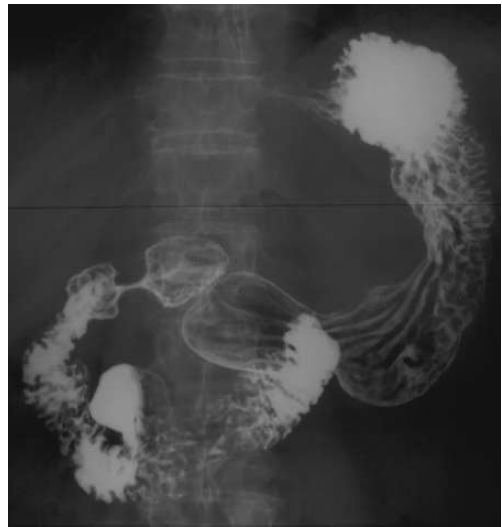
Figure 2. Duodenal diverticulum.

doscopic findings were negative in 9, but in two coloileoscopy with biopsy showed inflammatory changes in the terminal ileum (Figure3).