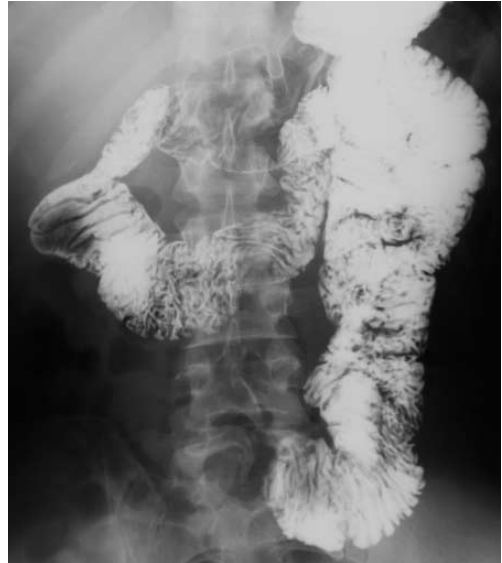
Figure 1. Compression of pars horizontalis duodeni by superior mesenteric artery.

Among 16 patients with suspicion of Crohn's disease, the radiologic findings were positive in 5, the diagnosis was later confirmed by endoscopy and biopsy. In 11 patients with negative radiologic findings, en-