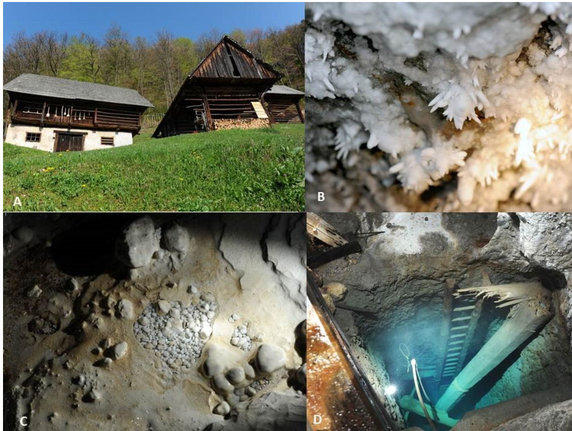
Fig. 2 A – Slapšak homestead, B – Aragonite urchins, C – Cave pearls, D - Drinking water catchment in the shaft