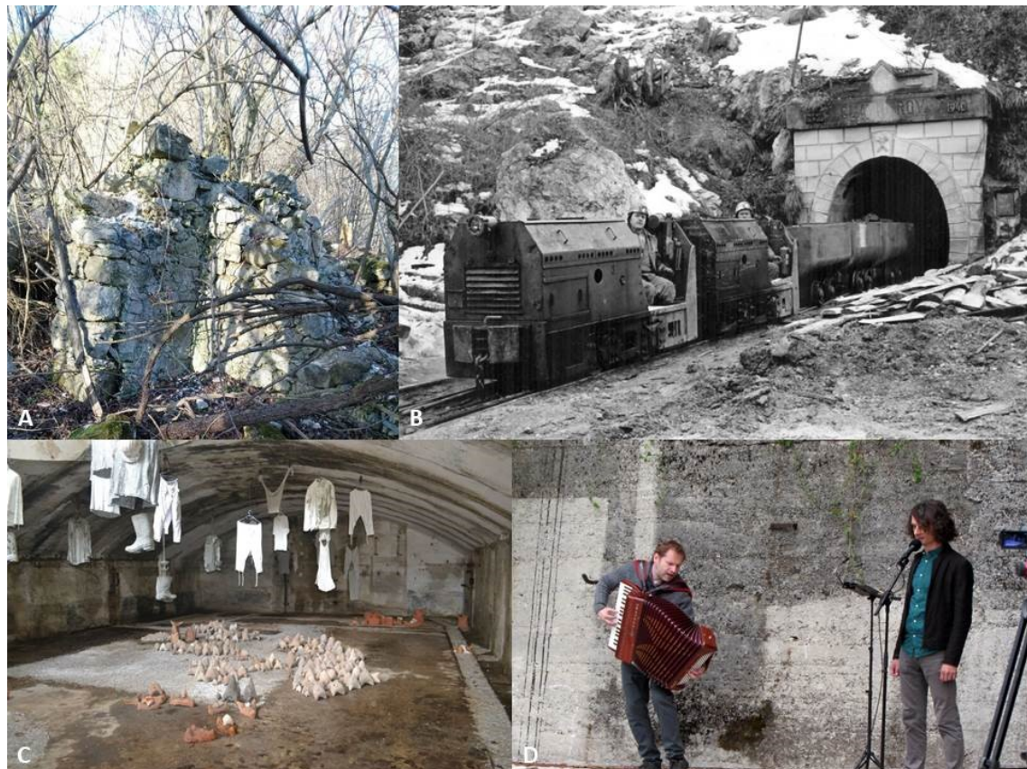
Fig. 3 Revival of heritage potential in Govce: A – The ruins of Govce village, B – Laško coal mine, C – Strojnica Gallery featuring the Odstiranja and Sence exhibitions, D – Music event in front of the Strojnica Gallery