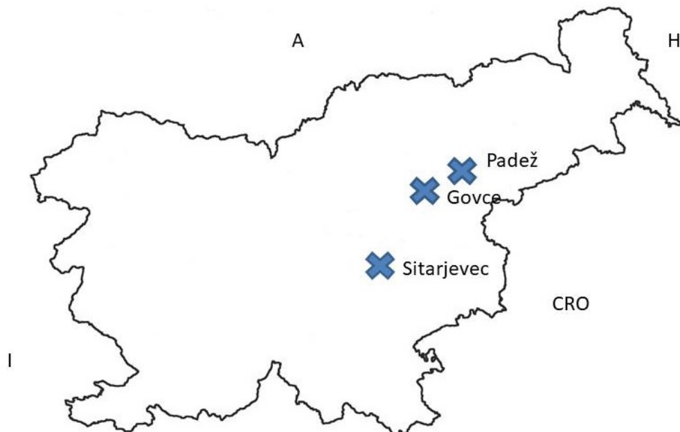
Fig. 1 Location of the revived mining heritage structures in the Posavje Folds in Slovenia

Two of many metal mineral deposits in the area have been revived, i.e. the Padež mine and Sitarjevec mine, while mining heritage related with the present coal extraction is available in Govce (Laško coal mine) (Fig. 1). The ore-bearing rock at the Padež and Sitarjevec mines is micaceous-quartz sandstone with inclusions of dark grey feldspar and siltstone, while mineralisation took place as a result of tectonic movements that caused the cracking of quartz sandstone and the penetration of hydro-thermal solutions enriched with ore minerals and flint in the cracks (Herlec et al., 2006). Coal seams in Laško are found in molasse deposits of the former Pannonian Sea (Mlakar, 1986).