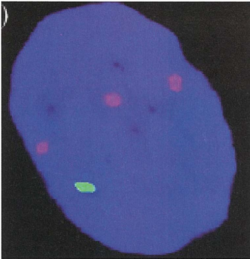
Figure 1. FISH images of nuclei from prostate cells from atrophic areas. 3 signal for centromere X (Spectrum Orange) and 1 signal for centromere Y (Spectrum Green).

in the immortalisation of prostate cells in cell cultures. 19 In the early stage of prostate cancer c-myc probably gives the cells a “proliferative advantage” allowing them to grow under unfavourable conditions. In advanced tumour stages, c-myc contributes to the androgen-independent growth of prostate cancer. 20