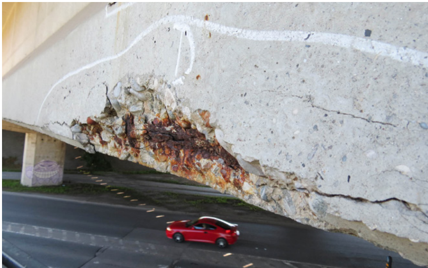
Figure 1. Delaminated concrete cover due to the corrosion of the reinforcement on a roadway bridge

Most of the roadway bridges, built before the adoption of modern principles of sustainable planning and seismic design, are approaching their design lifetime. The volume and loading of the heavy freight vehicles, which they are carrying, are considerably larger than anticipated at the time of their construction. In most cases, these bridges are structurally deficient and degraded due to the ageing effects and inadequately maintained (Figure 1). Reliable assessment of their safety to seismic and increased operational loads is therefore required before deciding on their optimal management.