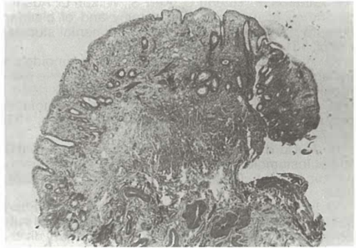
Fig. 3 — A benign polyp of the rectum. Slightly hyperplastic mucosa with proliferation of smooth muscle bundles is seen (HE \times 13).

bundles was not unlike to the case described by Ali et coworkers (1), (Fig. 3).