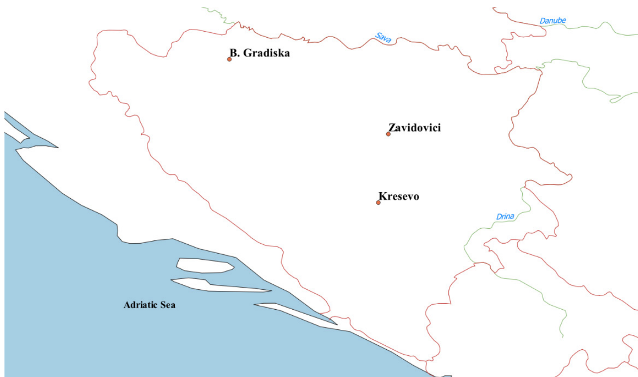
Figure 2: Distribution of provenance tests