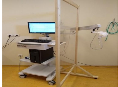
Figure 3: a) An extraction hood positioned immediately over the dosimeter/nebuliser. b) Large Protective screen on casters, separating patient from staff, providing some droplet protection if the patient coughs.