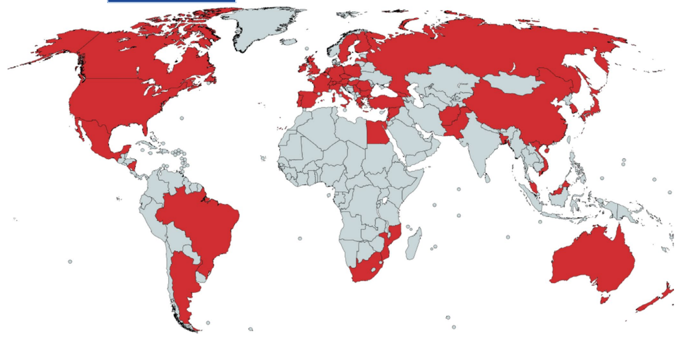
FIGURE 1 Geographic representation of the experts

The same approach was used for the research questions. Two research needs were dropped.