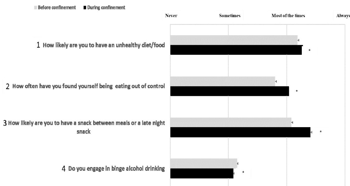
Figure 1. Participants’ scores in response to the related diet behaviour questions. *: Significant differences between “before” and “during” COVID-19 home confinement period.

Recorded scores in responses to the diet behaviour questionnaire before and during home confinement are presented in Figure 1 (question 1 to 4) and 2 (question 5). For detailed distribution of responses (in %), please see Table S1 (Supplementary File).