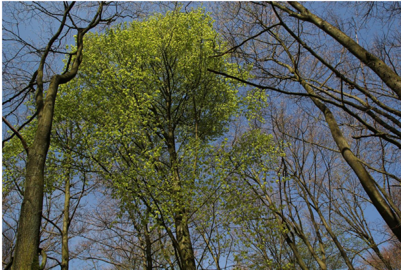
Fig. 1. Inter-individual variability of bud-burst at the beech stand of the Park of Brasschaat. 17/04/2018.