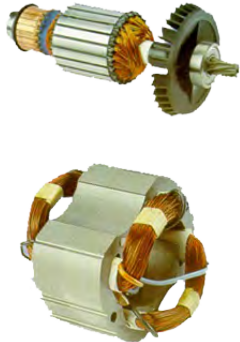
Figure 1: Rotor and stator of an electric motor [10].

The rest of the paper is organized as follows: Section 2 briefly describes the geometry elements of an electric motor and the optimisation goal; Section 3 presents the conventional manual approach to the motor design; in Section 4 the use of evolutionary algorithms in electric motor design is outlined; Section 5 introduces the new developed platform for remote optimisation; and Section 6 draws conclusions and proposes possible future work.