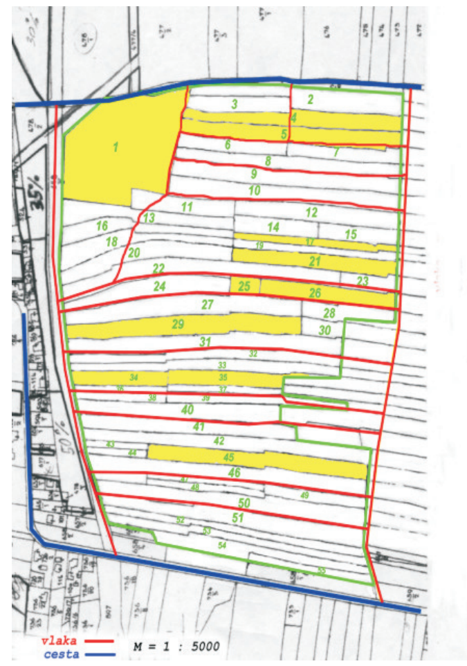
Fig. 1: Arrangement of plots on research object (yellow labelled lots are lots selected by sampling, red - skidding trail, blue - forest road)

Table 1 shows list of sample units. It is evident that in most cases one owner possesses several plots. Predicted productivity has been calculated according to production conditions on each owner's property. Bunching and skidding distance vary from plot to plot. Because of that fact, the entrance for calculation of productivity depends on the conditions on each plot. We calculated average bunching distance and average skidding distance for plots of individual private owners. As the skidding conditions are homogeneous across the whole study area, while the skidding distance varies, we used the individual private owner's properties to form skidding units.