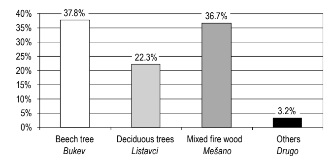
Figure 1: Prevailing tree type among the questioned households using chunkwood