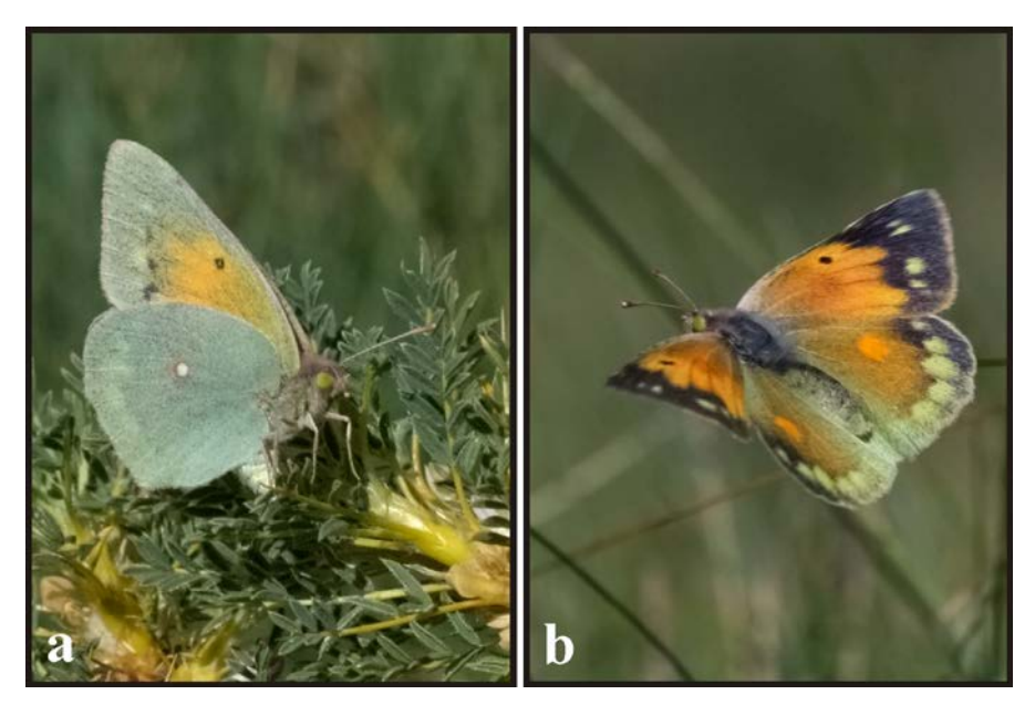
Figure 3. Female ovippositing on Astragalus thracicus (a) and gliding along the slope searching for oviposition spot (b). Slika 3. Samica pri odlaganju jajčec na Astragalus thracicus (a) in iskanju mesta za odlaganje jajčec (b)