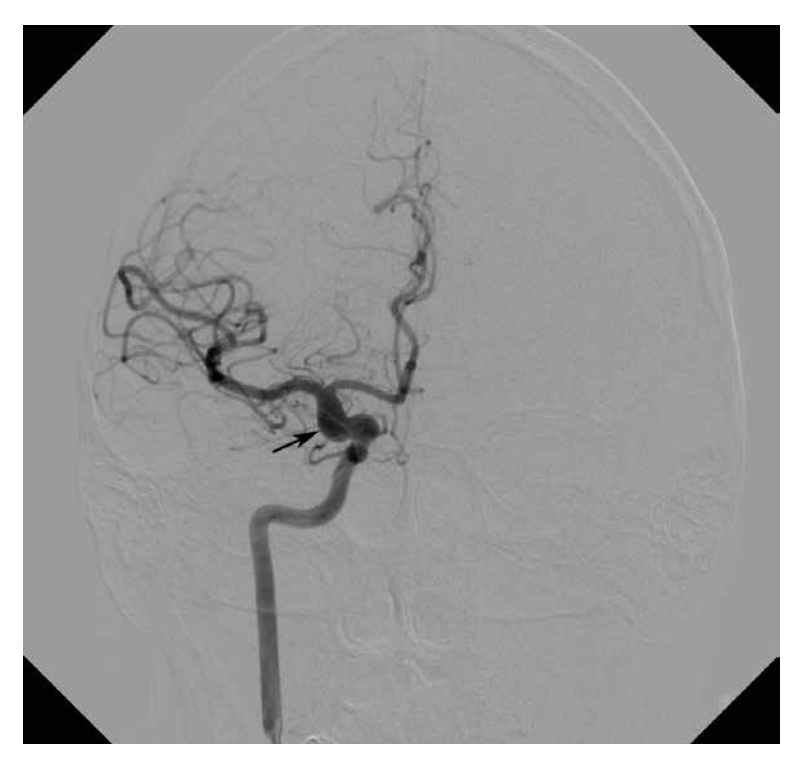
FIGURE 1. A fusiform aneurism of the internal carotid artery is indicated by the arrow.

The aim of the study was to evaluate flow diverter device Pipeline for broad neck and giant aneurysm treatment.