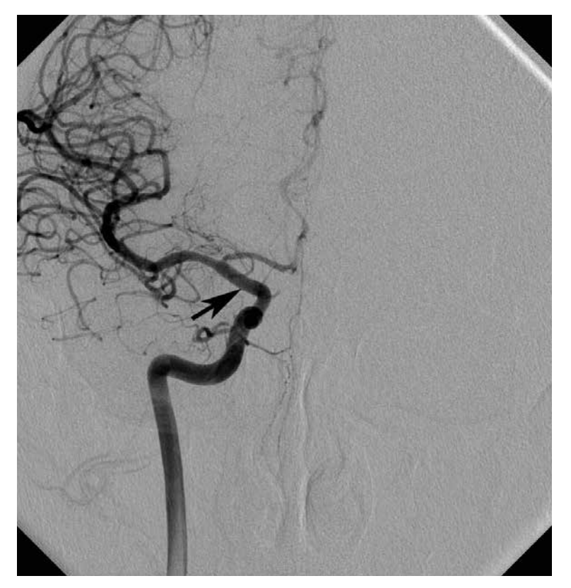
FIGURE 4. Control DSA after 12 months shows complete thrombosis of the aneurism (arrow) and good patency of the distal arteries.

eral weeks or months after placing the flow diverting stent. In the case of endovascular aneurysm closure with coils residual filling of the aneurysm, after Roy-Raymond scale, is a bad result. Residual filling of the aneurysm in the case of flow diverting stent placement however is acceptable and even desirable.<sup>14</sup>