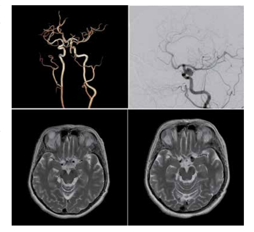
FIGURE 5. Control MR after 12 months shows complete thrombosis of the aneurism (arrow) and aneurysm collapse following flow diverter treatment.

Concerns that may arise with the use of flow diverting stents are the formation of thrombus within the aneurysm and its fibrous transformation. Review of literature and experience in placing the flow diverting stents in the treatment of the aneurysms of the abdominal aorta show that after the formation of the thrombus, especially in giant aneurysms, the thrombus can get infected causing swelling and headaches. The extent of these symptoms is often related to the size of the aneurysm. The focus of the inflammation is in the thrombus within the aneurysm.<sup>18</sup> In favor of this hypothesis are a number of published cases with extensive edema around a giant aneurysm before the treatment of the aneurysm. Inflammatory changes may also be present in the wall of small aneurysms,