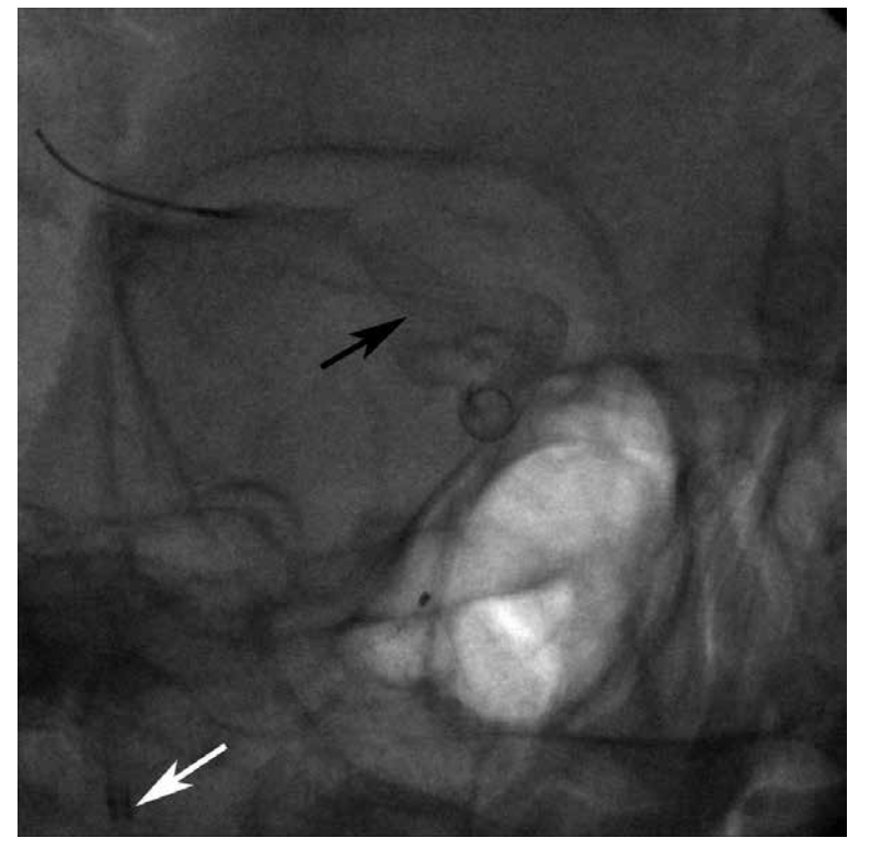
FIGURE 2. The position of the flow diverter stent on the native radiogram is indicated by the black arrow. The white arrow indicates the tip of the guiding catheter.

Closing of the aneurysm is a long process and therefore angiography after stent placement does not say much about the effectiveness of the intervention. The process of stagnation of blood and thrombosis of the aneurysms may persist for sev-