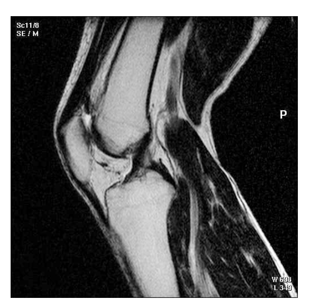
FIGURE 4. Anterior cruciate ligament (ACL) flexion MRI technique.

All patients suffered from a knee injury which mechanism pointed to the lesion of internal soft tissue structures and thus potentially to the ACL injury. The anterior drawer test was positive in 94 patients (63.1%), out of them 86 (57.7% of total patients) had positive Lachman test. In the remaining 55 (36.9%) patients, MR examination was performed on the basis of the mechanism of injury (from patient's history) and clinical suspicion of a violation of the ACL.