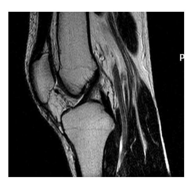
FIGURE 3. Anterior cruciate ligament (ACL) sagittal-oblique T2 FSE image.

All 149 patients (108 males, 41 females) were sent to MRI examination with a clinical diagnosis: internal knee lesion-meniscal or ACL lesion. In 59 patients (39.6%) referring diagnosis was decisive – ACL lesion.