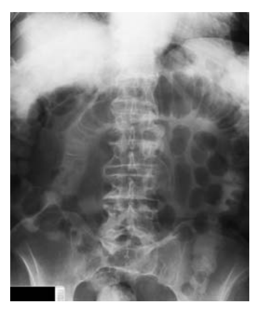
Figure 1 . Abdominal plain film: dilated small bowel loops – obstruction.

An 83-year-old man with arterial hypertension was first referred to the proctologist because of difficult defecation, abdominal pain and diarrhoea lasting for about one month. On proctoscopy, polyp of 5 – times 5 mm was found in the rectum. It was resected at a later colonoscopy and sent for histological examination. Some diverticula were also observed. With the upper GI endoscopy signs of chronic atrophic gastritis were found. With abdominal ultrasonography small cysts in the right kidnev were revealed. However, the results of all examinations could not explain the patient's problems. Two months later the patient returned to the emergency department, for the third time in one month, because of severe vomiting and weight loss. Haemoglobin level was found normal. Dilated small bowel was observed on abdominal plain film (Figure 1), while no signs of acute abdomen were seen on physical examination, leading abdominal surgeons at the first two patient's visits to conclusion that there was no indication for surgery. At the third patient's visit to the