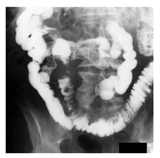
Figure 2. SBFT: Stenosis and an oval formation in the distal jejunum, causing a relative obstruction, thickened mucosal folds and irregular bowel wall proximally.

The patient was admitted to surgery. Implantation of pace maker for his arrhythmia was needed before he could be operated upon (5 days later). A 30 cm long segment of the jejunum was resected. Appendectomy was also performed. The histopathologic diagnosis was adenocarcinoma of the small bowel. One out of 17 nodes in the mesentery was found malignant. Lymphangiocarcinomatosis of the mesentery was also established.