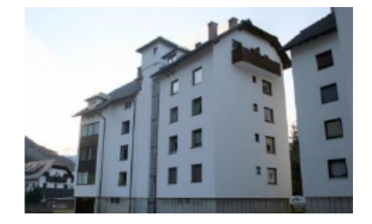
Figure 2. Illustration of the reference building

In the second part, the difference in the results after the allocation of the impacts is presented. The results of the last step are presented in this part.