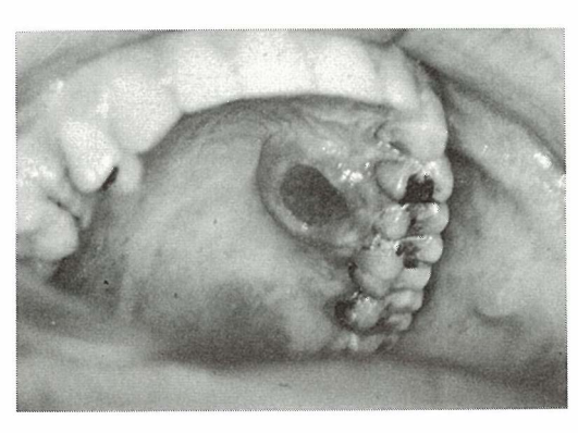
Figure 1. Preoperative intraoral view of the exulcerated tumor arising from hard palate.

Clinically, a shallow lesion with diameter of 2 cm and central ulceration was present (Figure 1). Specific ulceration was excluded by dermatovenerologist. Local x-ray picture and panoramic radiograph showed partially well and partially illdefined radiolucency of the alveolar