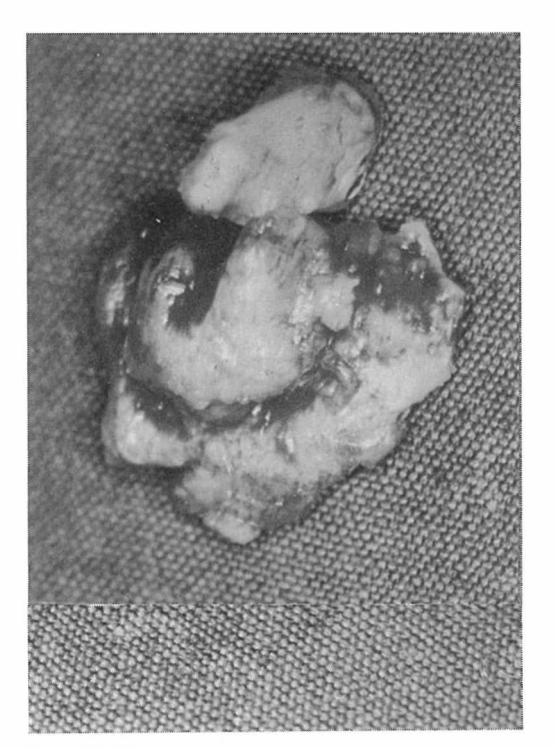
Figure 2. Gross appearance of the tumor after enucleation.

process of maxilla on the right side. A biopsy was performed. The initial histological diagnosis was leiomyoma. The lesion was treated by enucleation and tooth extraction. On surgery, the tumor has been shelled out from the bone (Figure 2). Because of the expansion of the tumour into the bone, a medullary bone origin of it was suggested. Histological examination of the surgical specimen showed that the tumor was leiomyosarcoma, moderately differentiated. Histologicaly, a dense population of neoplastic spindle cells was seen, showing low to moderate mitotic activity (13 mitoses per 50 HPF). Tumor cells showed reactivity to smooth muscle actin. Resected margins were not free of tumor at the base of lesion, so additional surgical management was necessary, without preoperative chemotherapy, which was not indicated because of low mitotic activity of the tumour. Before undertaking further local therapy, the search for a possible primary tumor on other location and/or metastases was performed, with negative results. Therefore, a second