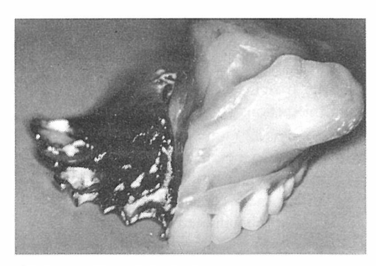
Figure 5. Maxillofacial prosthesis.